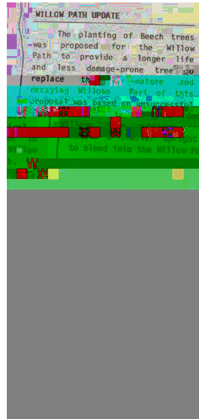
[Figure 14: The Open 'Gate, 1989]