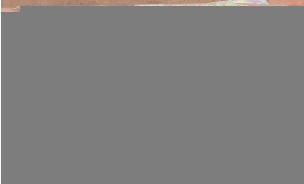
[Figure 8: Taylor Lake, 1946. Buildings and Grounds A1000]