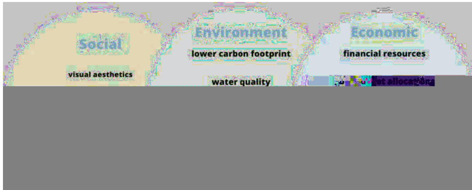
[Figure 3: Sustainability Criteria: Social, Environment, and Economic]