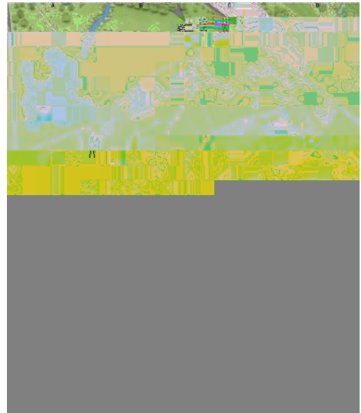
[Figure 1: Scope of Campus (Colgate University)]